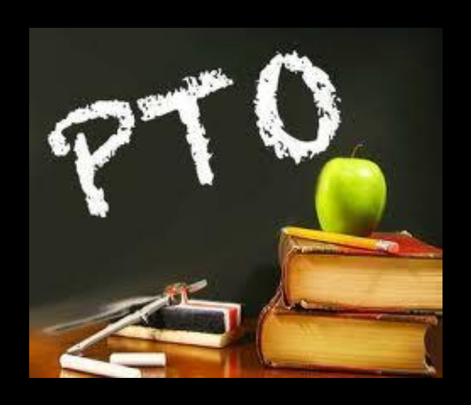
Parent Teacher Organization

The Bound Brook PTO is a Parent Teacher Organization that is organized for the purpose of supporting the education of the children in Bound Brook by fostering relationships among the schools, parents, and teachers.